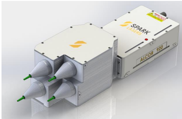
ALCOR MULTIBEAM MB4 with 4 outputs